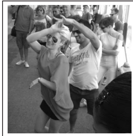
Dancing in the streets of Havana