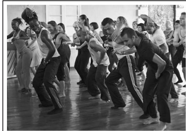
Authentic Rumba Guaguano