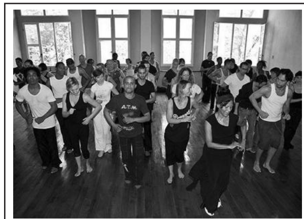
Cuban Cha Cha Cha